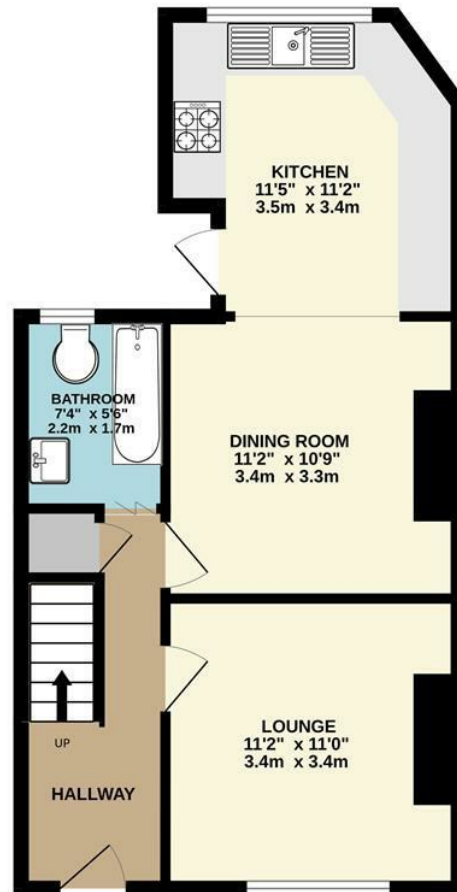
GROUND FLOOR 462 sq.ft. (42.9 sq.m.) approx.